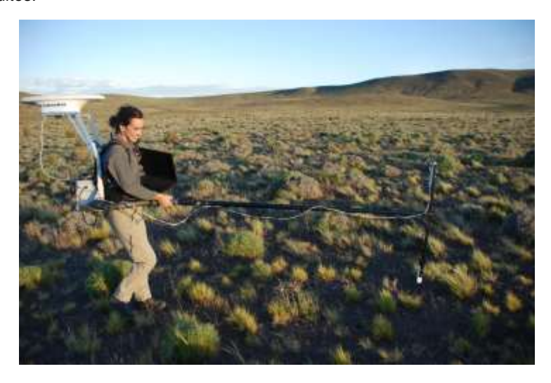
Figure 1.- Surveying system where NEWTON first prototype will be integrated.

In order to achieve this, the head of the sensor is a resonant circuit with an open autoinductance "L". The susceptibility is measured by the change in the L due to the closure of the gap when a rock approaches the head. A first prototype has been conceived to be part of a surveying system (Fig. 1) in which the head is approached to the rocks during the tracks and therefore there is no need to load the samples, which simplifies the prospections. A latter prototype will be developed for near future planetary rovers as part of the geological suites.